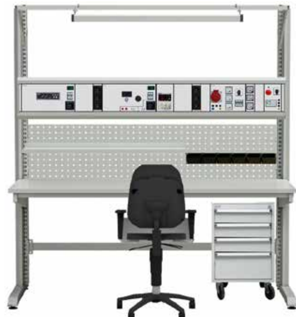
Electric maintenance workstation